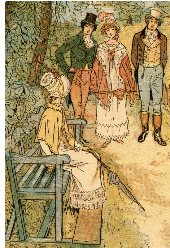
↑ Illustration by Henry Matthew Brock (1898) from Mansfield Park by Jane Austen. 'Miss Price is all alone!'