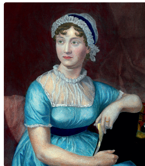
↑ Portrait of Jane Austen. 19 th -century coloured engraving likely derived from a portrait by her sister Cassandra.

These social events are only apparently frivolous: Austen treats social interactions as opportunities to put her characters under a magnifying lens through which she can observe their peculiarities, evolving personalities, qualities and faults. Austen's novels do not make explicit reference to political or historical events: the historical macrocosm never intrudes into Austen's ideal microcosm, preserving it as a magic stage where characters explore universal themes such as self-realisation, growth, prejudice, social conventions and class prejudices.