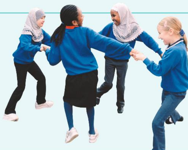
► Students playing 'ring-around-the-rosy' in the school playground.