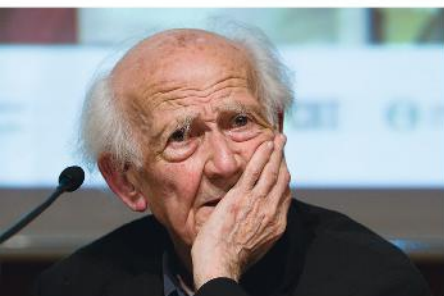
▲ Polish sociologist Zygmunt Bauman.

In the context of contemporary multicultural societies, cultural differences are not just tolerated: they are (or at least should be) respected and promoted as an opportunity for understanding and mutual growth. Multiculturalism is an essential condition of the contemporary 'globalised' age, in which national boundaries are weakened and replaced by concepts such as interconnectedness, interdependence, and global networks. The phenomenon of globalisation , in particular, and its consequences on the perception of the self and of its cultural boundaries has been the object of analysis by the Polish sociologist Zygmunt Bauman (1925-2017), who coined the expression ' liquid society ' to refer to the fluid psychological dimension of the contemporary self, torn between continuous changes, constant transformations, endless hybridisations, and the impossibility of relying on stable relations.