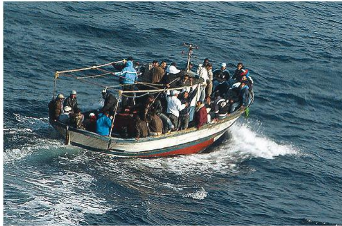
◀ A human trafficker boat crowded with illegal immigrants.

Asylum is a particular kind of protection offered by a country to people who have been forced to leave their country because their lives are in danger.